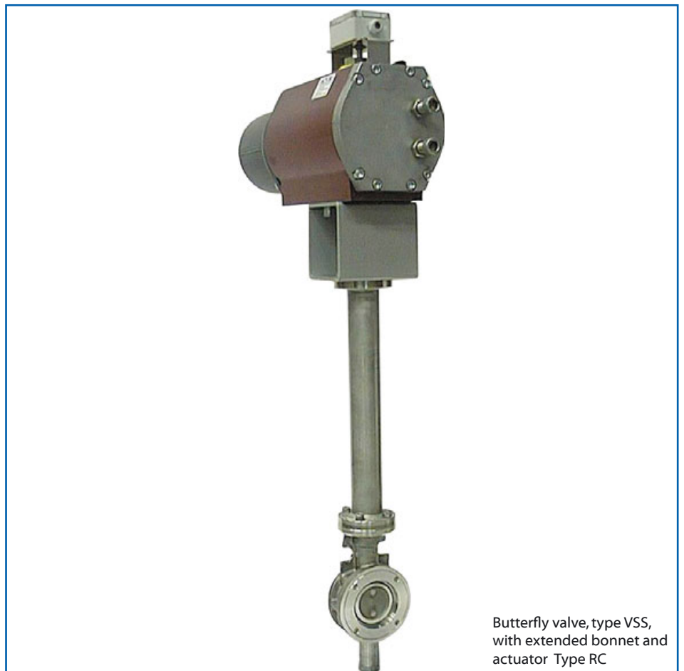
Butterfly valve, type VSS, with extended bonnet and actuator Type RC

The valve assemblies are delivered factory tested as complete units with actuators, positioners and accessories.